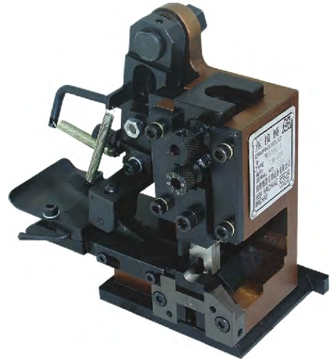
该类型模具具有普通型 ( YJM-4X/100 ) 和精密型 ( YJM-S5/E5 ) 两种配置