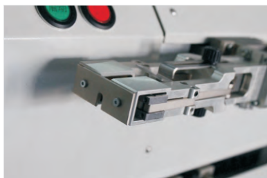
夹线组件 Wire Clip Kit