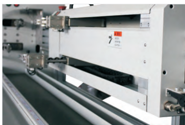
双工位 Double Station